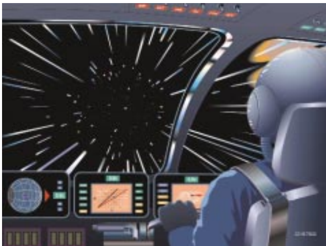
NASA BR/LES BOSSINIS

Spacecraft capable of interstellar travel will approach the speed of light, and may have to extract energy from the vacuum of space. However, researchers could be years or decades from achieving the breakthroughs necessary to build such a propulsion system.